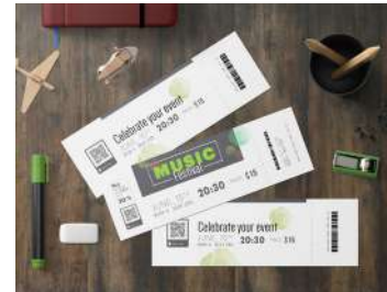
Events Ticket Control